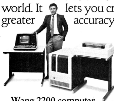
Wang 2200 computer.

The Wang 2200 isn't expensive. And since it's designed to expand as your business expands, you don't have to worry about protecting your initial investment. It's no wonder more and more people are choosing the Wang 2200 as a small business partner: it carries its weight without asking to have its name put on the door.