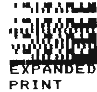
Alternate Font at 16.5-Pitch (U.S., U.K. and Azerty Character Set)

&@i0aæi0uæ0å0ü !"#$%&'()*+,-./ 0123456789:;<=>? @ABCDEFGHIJKLMNO PQRSTUVWXYZ[\]^_` °abcdefghijklmnop pqrstuvwxyzšššššš .♦▶◀→L|'"/\^°#||$%&' -♦▲▼↓↑~°{ }Δ□