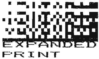
Alternate Font at 10-Pitch (U.S., U.K. and Azerty Character Set)

&@i0aæi0uæ0å0ü !"#$%&'()*+,-./ 0123456789:;<=>? @ABCDEFGHIJKLMNO PQRSTUVWXYZ[\]^_` °abcdefghijklmnop pqrstuvwxyzšššššš .♦▶◀→L|'"/\^°#||$%&' -♦▲▼↓↑~°{ }Δ□