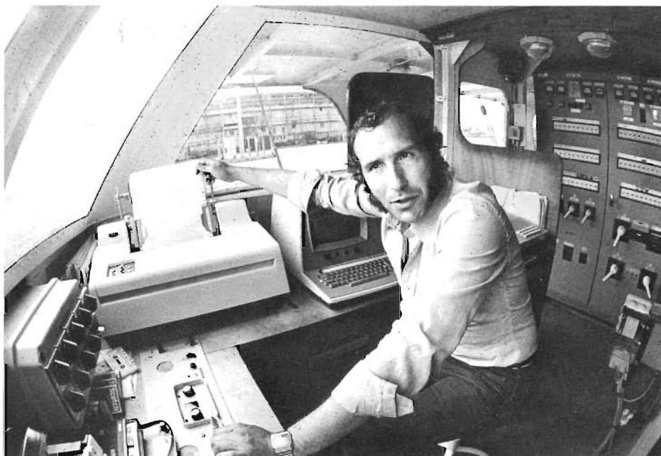
Alain Colas, Captain of the Club Mediterranee

Colas' single-handed, trans-Atlantic crossing, the Wang computer gathered data on the ship's progress from 14 different instruments. Colas was able to "program" maximum and minimal limits on any of those instrument readings, and the computer sounded an alarm whenever any of those limits was exceeded.