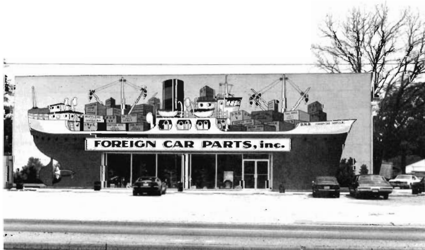
Foreign Car Parts, Inc.